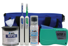
FCP2 Fiber Cleaning Kit for SC/ST/FC/LC