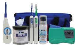
FCP2 Fiber Cleaning Kit for SC/ST/FC/LC/MPO