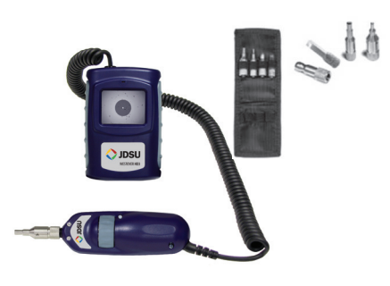
FBE-SM2-CATV (Low-Cost Field Solution)

400X Magnification FBE Inspection Probe Hardwired to Display (2.0"LCD)