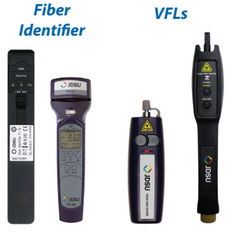
FI-10 FI-60 FFL-050 FFL-100