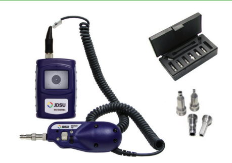
FBP-SM03-CATV (Standard Field Solution)

400X Magnification FBE Inspection Probe Hardwired to Display (2.0"LCD)