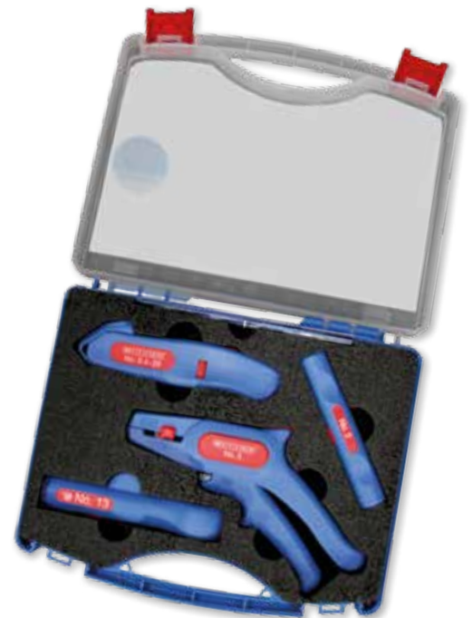
Starter Set Pro