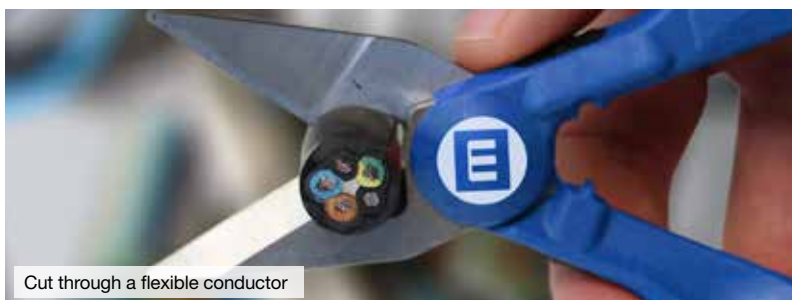
Cut through a flexible conductor