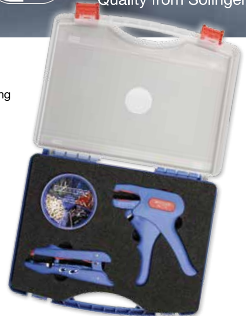
Crimp Set Pro

The practical shaker with five different wire ends (DIN 46228) of 0,5 bis 2,5 mm 2 completes the set.