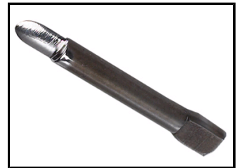
Spare blade Tor

Tor is a professional stripping tool for cables of all insulation types. By rotating the body of the tool the blade can be fixed in any one of three positions providing circular cuts about the cable and lengthways or spiral cuts along the cable. Unique to this type of tool Tor features interchangeable cable retention hooks giving it an incomparable cable stripping capacity of up to 40mm/1.5 inch diameter in one tool. Designed to fit the hand and for ease of use, Tor can strip the most difficult cables in the harshest of environments.