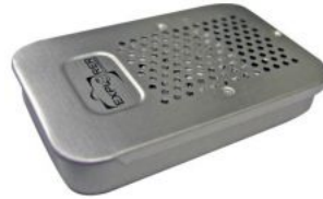
KIN.0481 - SILICA BOX