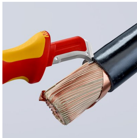
Guide shoe 98 55