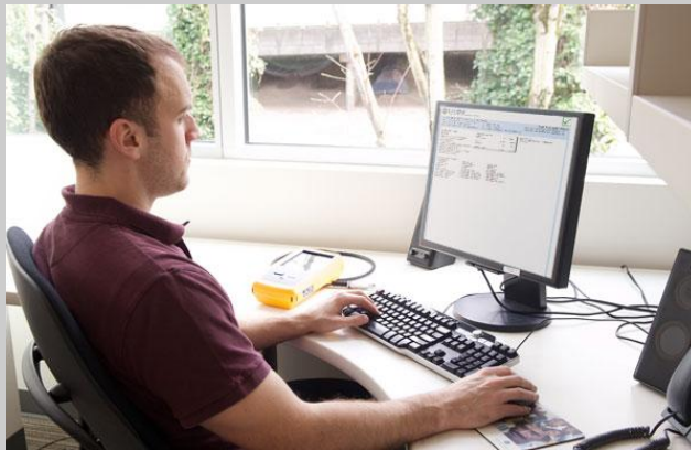
LinkWare Report with Encircled Flux and Test Reference Cords Tested